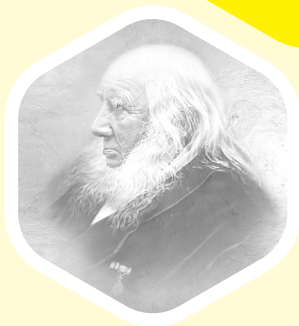
Philosopher & Educationist Bishop N. F. S. Grundtvig (1783-1872)